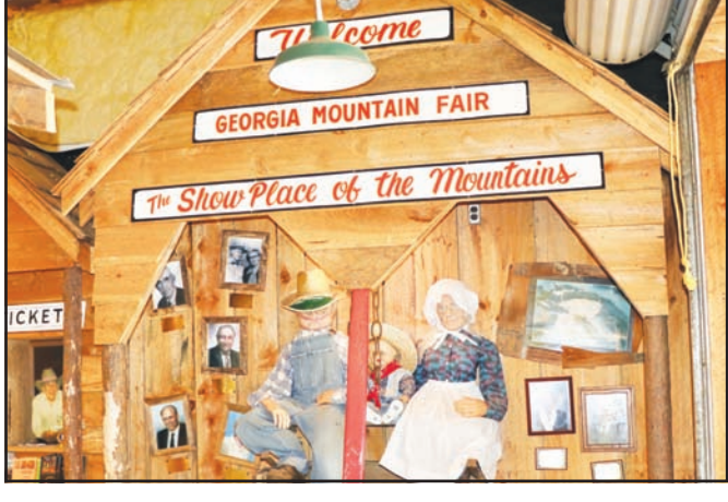
"Welcome to the Georgia Mountain Fair - The Showplace of the Mountains."

Area residents will want to make sure to line the streets "We're still taking applications, com. of Downtown Hiawassee as the and we need more girls to