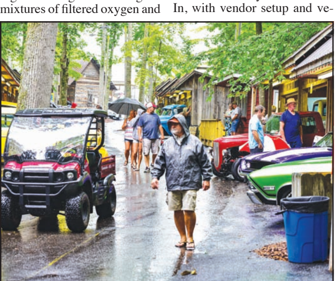
Rain put a damper on this year's Moonshine Cruiz-In, though the turnout was still good, all things considered.

During the event's previous 10 years, the only rumble heard in and around the Georgia Mountain Fairgrounds has been the reverberating purr of big block engines feasting on