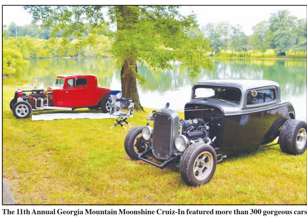
at the Fairgrounds last week.